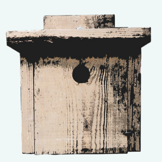
Nest box for Chickadee