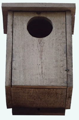
Nest box for Owl