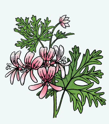
2 Geranium plants