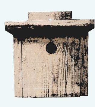
Nest box for Chickadee