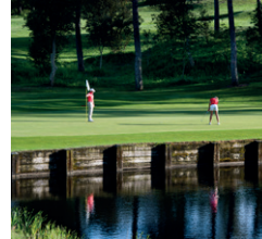
20/07/19 SUMMER TOURNAMENT PGA (Tour Course)