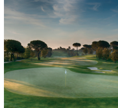
13/07/19 - 14/07/19 NUMA GOLF (Tour Course)