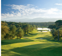
04/07/19 BMW TOURNAMENT (Stadium Course)