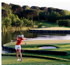
24/08/19 - 25/08/19 NUMA GOLF (Stadium Course)

In a superb natural setting, golf lovers have at their disposal two excellent 18-hole courses and the perfect practice facilities to enjoy a competitive game of golf or a social tournament. There is a format for everyone to make the most of the No.1 Golf Resort in Spain.