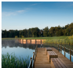
28/07/19 SUMMER TOURNAMENT PGA (Tour Course)