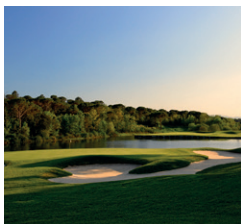
26/07/19 ROLEX TROPHY (Stadium Course)