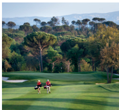
17/08/19 SUMMER TOURNAMENT PGA (Stadium Course)