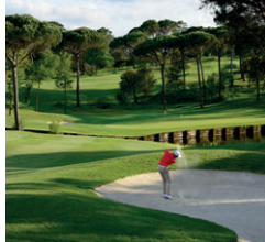
07/07/19 SUMMER TOURNAMENT PGA (Tour Course)