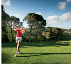
06/07/19 CLUB ME GUSTA (Stadium Course)