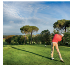
10/08/19 SUMMER TOURNAMENT PGA (Stadium Course)