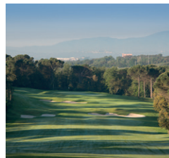
03/08/19 SUMMER TOURNAMENT PGA (Tour Course)